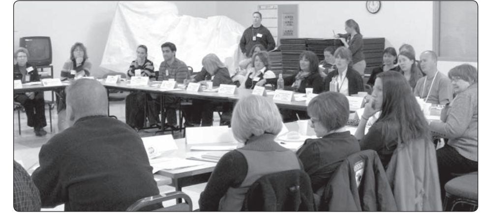
DOC Correctional Staff and Animal Rescue representatives from across Washington State gather at WCCW to mingle and collaborate about prison-based animal programs.

Housing and training dogs and cats in an adult correctional facility is a uniquely challenging prospect.